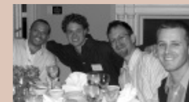
Friends around the table.

As Dr. Moltmann shared in his Capps Lecture, "There is a trust in God which made Abraham and Sarah ready to wander as strangers through strange lands in order to follow the star of God's promise. This trust in God's promise for the future is what the New Testament calls faith... The biblical stories from Noah to Jesus are stories about this confidence in the future, confidence in the promising God. It puts men and women at odds with their familiar and trusted environment, and makes them ready to let go of the old and to look for the new thing which God has promised. It does not familiarize them with their environment; it alienates them from it. But this makes them capable for the future, and free.