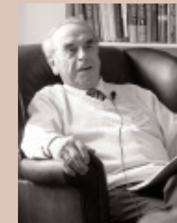
Dr. Moltmann at the Bonhoeffer House.