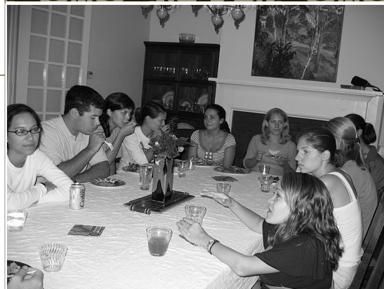
University of Virginia students at Theological Horizon's Fall semester Welcome Lunch for the Vintage Bible study

Combine all ingredients except Brie in a heavy saucepan. Cook over medium-high heat, stirring frequently, until most berries burst, 5 minutes. Cool to room temperature, cover, and refrigerate. Preheat oven to 300 degrees. Cut the rind off the top, leaving a 1/2 inch border around the edge. Place brie on a foil lined cookie sheet and spread with cranberry marmalade. Bake for 12 minutes, or until soft. Serve with crackers and fruit slices.