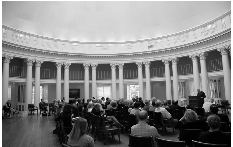
The Dome Room of the Rotunda during the 2008 Capps Lecture

Theological Horizons' mission is to renew thinking and discipleship in the church, the academy, and the community. The Capps Lectures embody this mission, bringing intellectual discourse and theological thought to a hungry community. Every year, our speakers look out upon a diverse range of faces in a filled room. The Capps Lectures are free and open to the public, and culminate in a question and answer session, allowing the