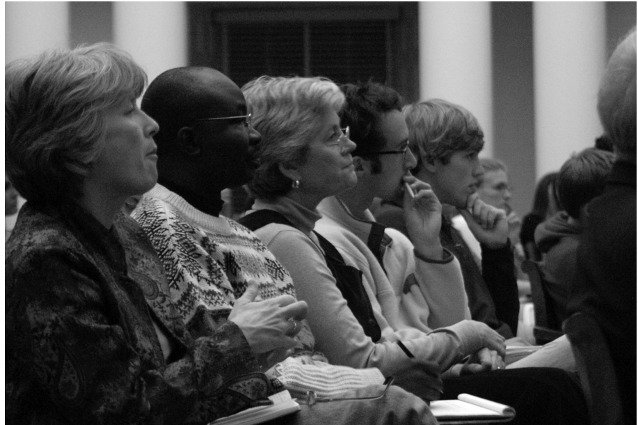
At the Capps Lecture in the Dome Room of the UVa Rotunda