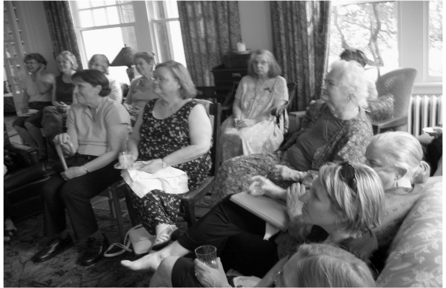
Women at the afternoon seminar on faith, illness, and recovery

We believe that God calls thoughtful Christians to address enduring, fundamental questions and to engage in current intellectual debates. Sustain Theological Horizons' mission to impact the heart of culture. We welcome your check, online donation or gift of appreciated stock... and your prayers. Thank you!