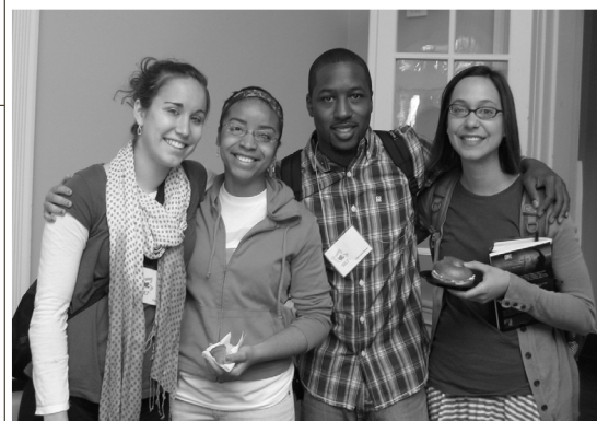
University of Virginia students at the 2009 Spring Institute for Lived Theology